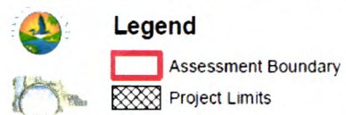
Royal Highlands Area L Road Paving MSBU